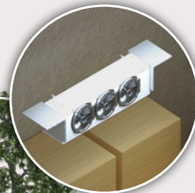
Cubic unit cooler 3C-A 1 > 35 kW