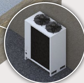
Encased outdoor condensing unit DUO CU MT/LT 6 > 49 kW