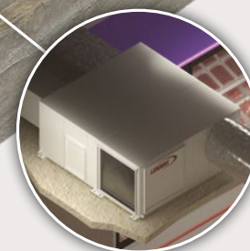
Air cooled rooftop packaged unit FLATAIR 24 > 85 kW